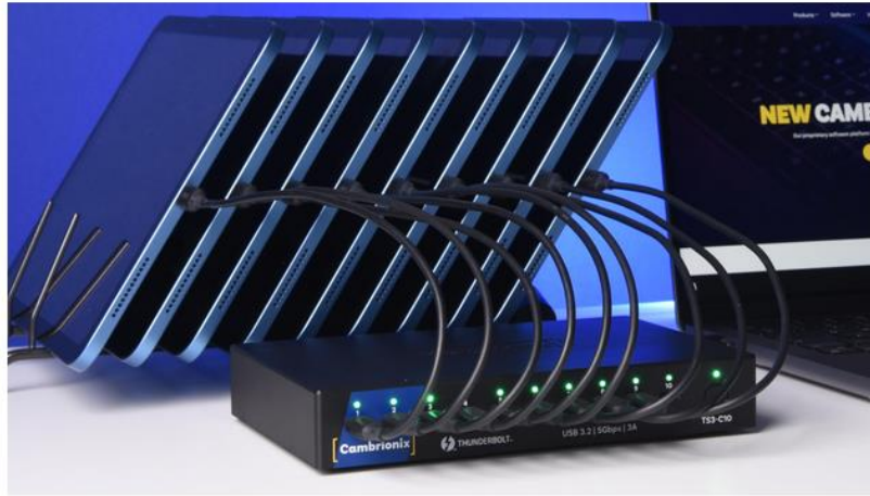
The ThunderSync3-C10 hub

In software quality assurance (SQA), every bug missed in testing risks costly fixes, damaged reputation, and delayed product launches. QA teams conduct thorough testing on real devices across multiple OS versions, hardware types, and network conditions to ensure software works exactly as intended in the hands of users.