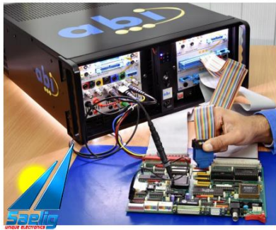
ELECTRONICS DIAGNOSTIC AND FAULT ANALYSIS