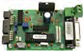
PIC-SERVO SC - DC Servo Motor Controller (KAE-T0V1)

The PIC-SERVO SC 3PH Motion Control Board is similar to the standard PIC-SERVO SC board above but with a higher current amplifier capable of driving brushless or brush-type DC motors.