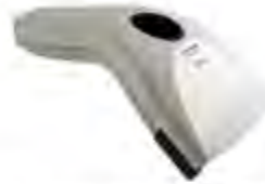
Fametech CS-700 USB Handheld Barcode Scanner (C)

The ComfilePi is a Raspberry Pi-based industrial touch panel PC. The CPI-S070WR utilizes the Raspberry Pi Compute Module 4S.