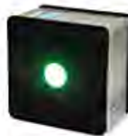
GL OptiLight LED 127 CLC (173088)

If you are looking for reliable, precise and intuitively operated spectral instrument for light assessment, our state-of-the-art light measuring tool GL SPEC TIS 1.0 touch is the best answer to all your spectral light measurement needs.