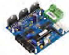
PIC-SERVO SC 3PH Motor Controller (KAE-T0V10-BD3P)

NHT 3DL has been designed to measure electromagnetic fields in compliance with all the main international standards and regulations. This device is able to adapt to future regulatory requirements using its completely reprogrammable system and structure.