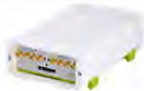
Sciospec ISX-3 Mini Impedance Analyzer