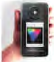
GL SPECTIS 1.0 Touch Spectrometer

The GL Spectis 1.0 Touch Flicker Spectrometer, is an upgraded version of the very successful handheld Spectis 1.0 Touch Spectral Light Meter. This device can now measure the increasingly important parameter of light flicker .