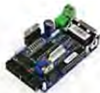
PIC-STEP Stepper Motor Controller (KAE-T3V1-BDV1)

The PIC-SERVO SC Motion Control Board is maybe the fastest and lowest-cost way of getting your DC servo motor up and running. The clear, explicit documentation and the Windows test utility program take the