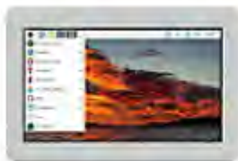
CPI-S070WR 7" Industrial Raspberry Pi Touch Panel

The ChargeBox FASTHub solution is an elegant and effective method of providing charging services previously unavailable before. It incorporates USB-C, Apple, and Qi charging methods using a low profile design. The FASTHub can charge Apple devices, USB 2.1, and USB-C devices.