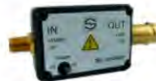
The Clipper CLP1500V15A1 Measurement Probe