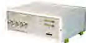
Sciospec ISX-3 EIT Impedance Analyzer

The PIC-STEP Motion Control Board is an integrated controller which includes both high-speed indexer functions and a power driver.