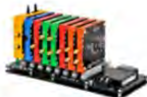
SpectraTronix C700 Modular RF Test Platform