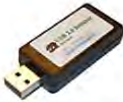
USB2ISO USB 2.0 Galvanic Isolator Adaptor