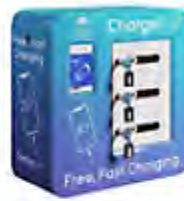
ChargeBox FAST3 Mini

Just plug your USB device into the USB2ISOs connector and then plug the USB2ISO into a HUB or PC. The PC and your USB device now have no electrical connection but can still talk to each other.