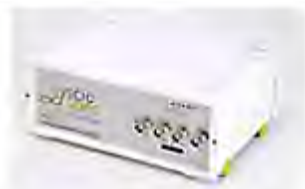
Sciospec ISX-3 Impedance Analyzer