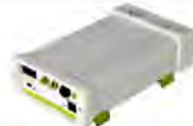
Sciospec LCR-1 LCR Meter